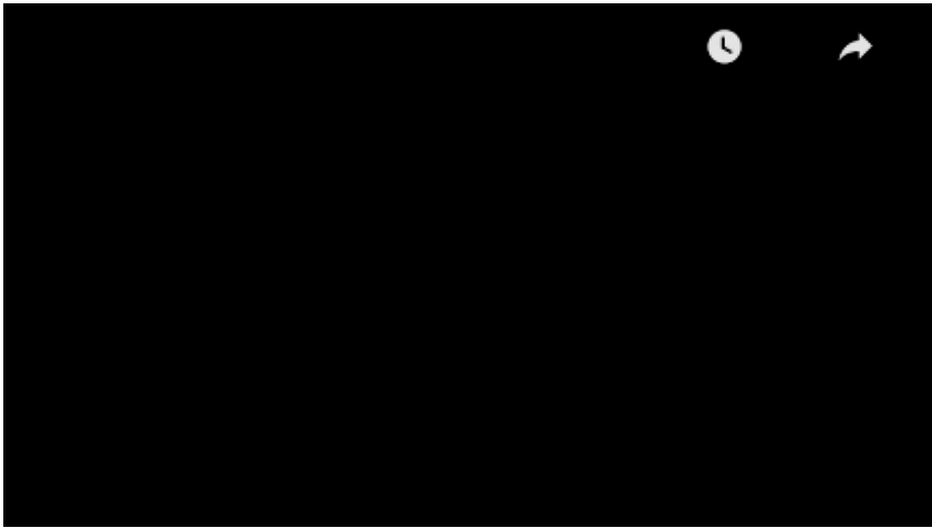
How to View your Health Card/eBenefit Card