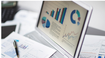
MERGERS & ACQUISITIONS