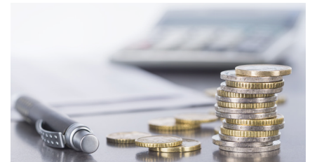
SALE AND LEASEBACKS