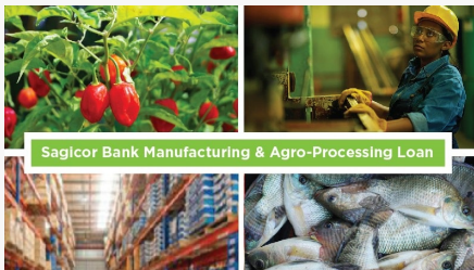
Sagicor Bank Manufacturing & Agro-Processing Loan