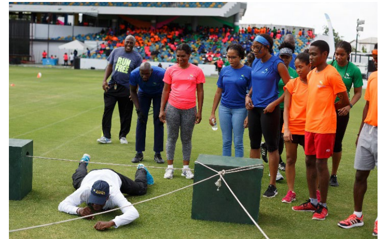
Sagicor Life Inc's and Sagicor General Inc's teams during a team building event at the historic Kensington Oval in Barbados.

The Sagicor Group Jamaica received the 2018 Silver Star Award as a Leader in HR Innovation for its establishment of the Pro Millennial Mentorship Society. The award was presented by the Human Resource Management Association of Jamaica (HRMAJ).